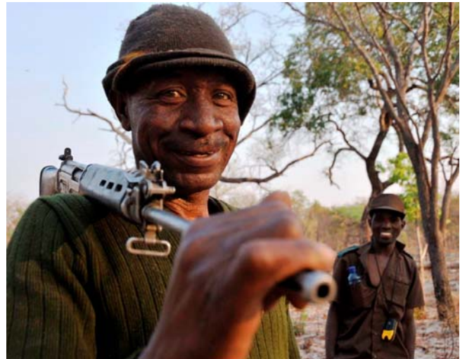
Photo 2: An MET ranger and community game guard on the Caprivi game count

A cornerstone of conservancy management is the employment of game guards. A typical conservancy will have six or more guards who routinely patrol conservancy areas and keep in contact with local farmers. Everybody knows who is who, and strangers looking for poaching opportunities are quickly spotted.